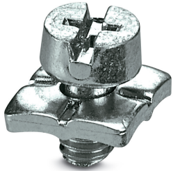
PE screw, for HC-HS contact inserts

Please be informed that the data shown in this PDF Document is generated from our Online Catalog. Please find the complete data in the user's documentation. Our General Terms of Use for Downloads are valid ( http://phoenixcontact.com/download )